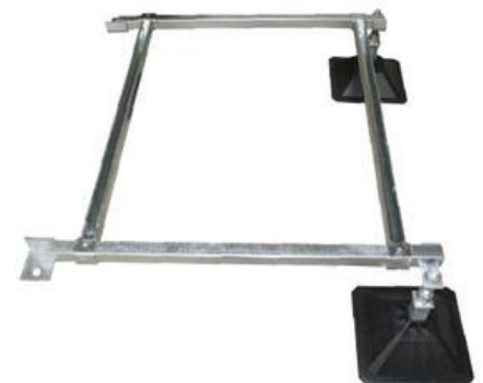
StrutFoot Plus system