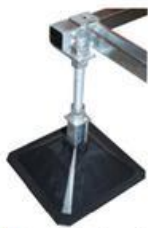
StrutFoot Complete Leg Assembly