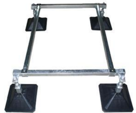
StrutFoot Base system