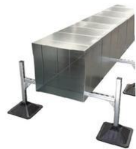
H Frame Kit (x2) Example Ductwork Installation