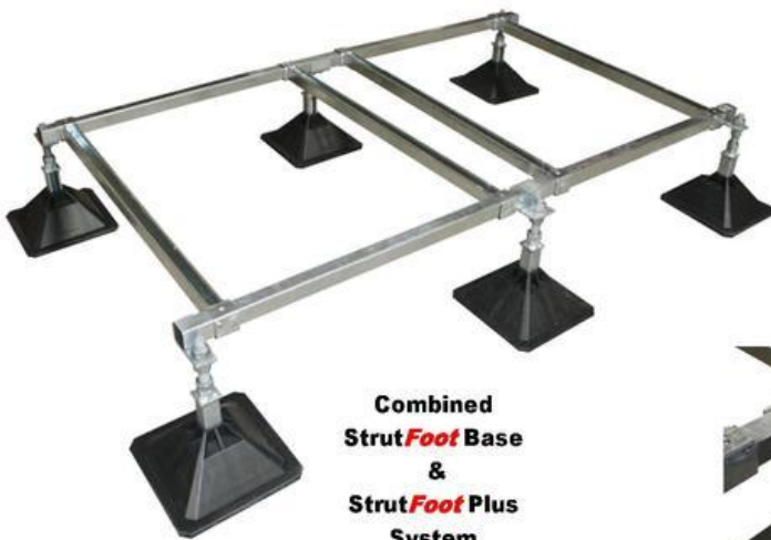
Combined StrutFoot Base & StrutFoot Plus System