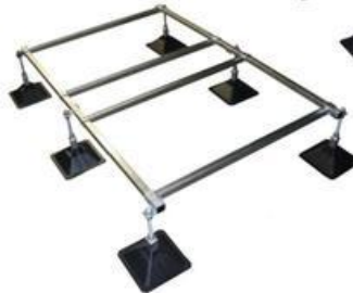
StrutFoot 4 system