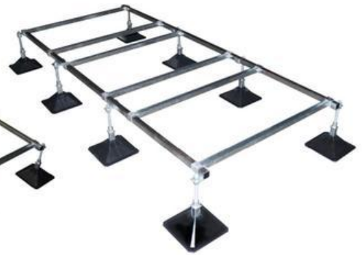
StrutFoot 6 system