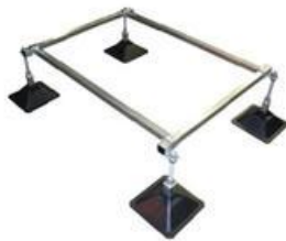
StrutFoot 2 system