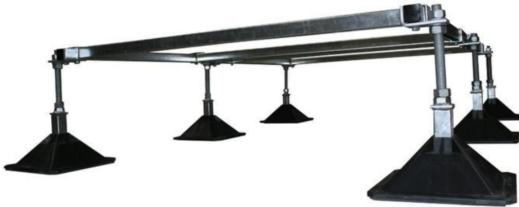
StrutFoot 4 system shown