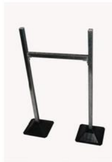
H Frame Kit Complete with Unistrut