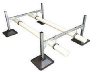
H Frame Kit (x2) Example Pipework Installation